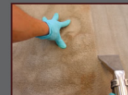
Carpet Deep Cleaning

Prices shown are for average case conditions and are not guaranteed for all conditions of vehicles. Color combinations, the age and the condition of your vehicle and how spectacular you want your vehicle to look are some key factors regarding pricing. AutoSport Detailing takes these and other factors into consideration before giving you an exact price.