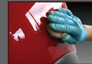
Clay Bar Paint Decontamination