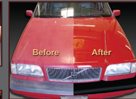
Paint Correction & Paint Sealant